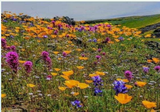
Table Mountain just above Oroville the County's seat, serves up a jaw-dropping spring wildflower bloom, breathtaking waterfalls, and a chance to hike through a truly unique natural area. Formed by ancient lava flows, the underlying basalt rock holds water, resulting in stunning vernal pools and dramatic waterfalls like ephemeral, but

spectacular, Phantom Falls. Grab a kite, a picnic basket or a water bottle and some hiking shoes and plan to spend a day at Table Mountain.